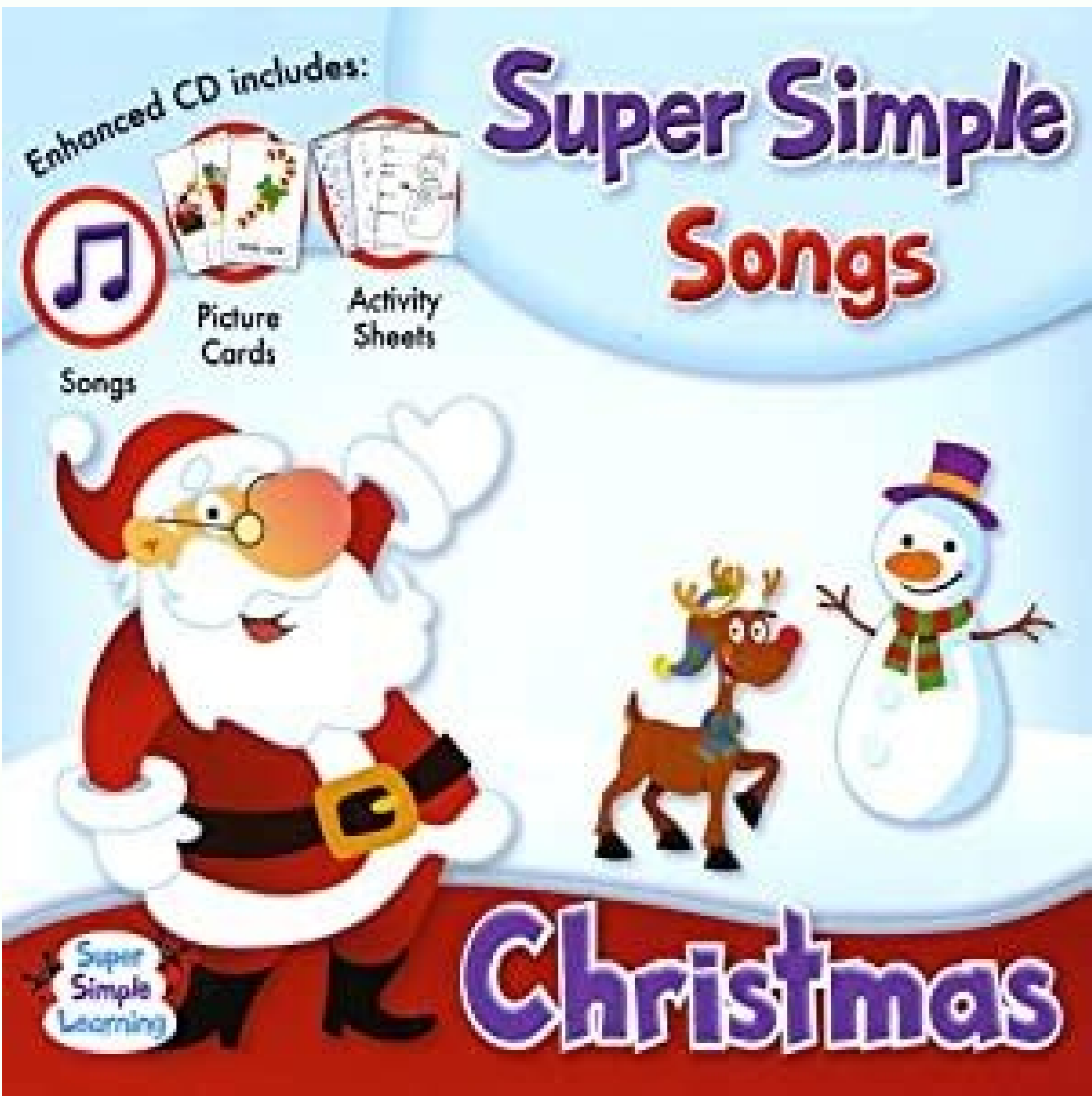
Super simple christmas songs. Super simple songs christmas songs.